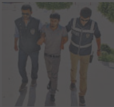
The 24-year-old suspect was arrested in Konya, more than 300 miles away